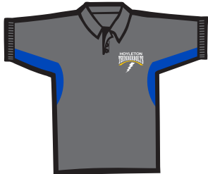
Moisture Mgmt. Golf Shirt $30.00 #3346