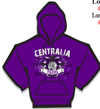
8oz Hooded Sweatshirt $17.00 #18500