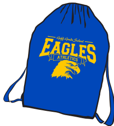
Sport Pack Bag $12.00 14" x 13" size #8888