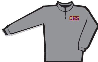
1/4 Zip Long Sleeve $21.00 #4102