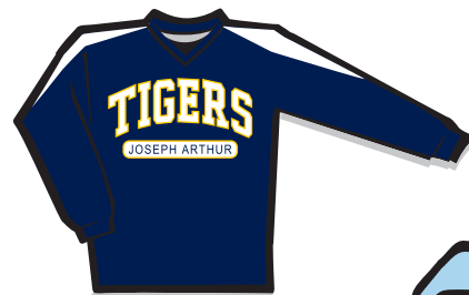
Nylon Windshirt $44.00 #229107