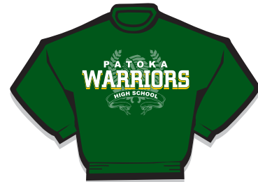
8oz Crew Sweatshirt $11.00 #18000