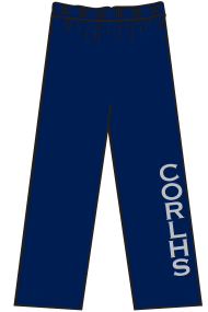
Sweatpants $14.00 #18400