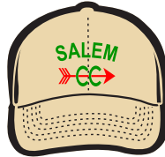
Twill Cap $10.00 #23-370