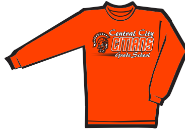
Long Sleeve T-shirt $9.00 #2400 Long Sleeve Dry-Fit T-shirt $10.00 #5104