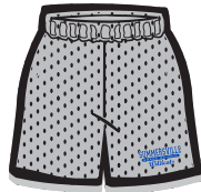
9" Mesh Short $11.00 #7209