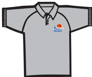
Golf Shirt $16.00 #72800